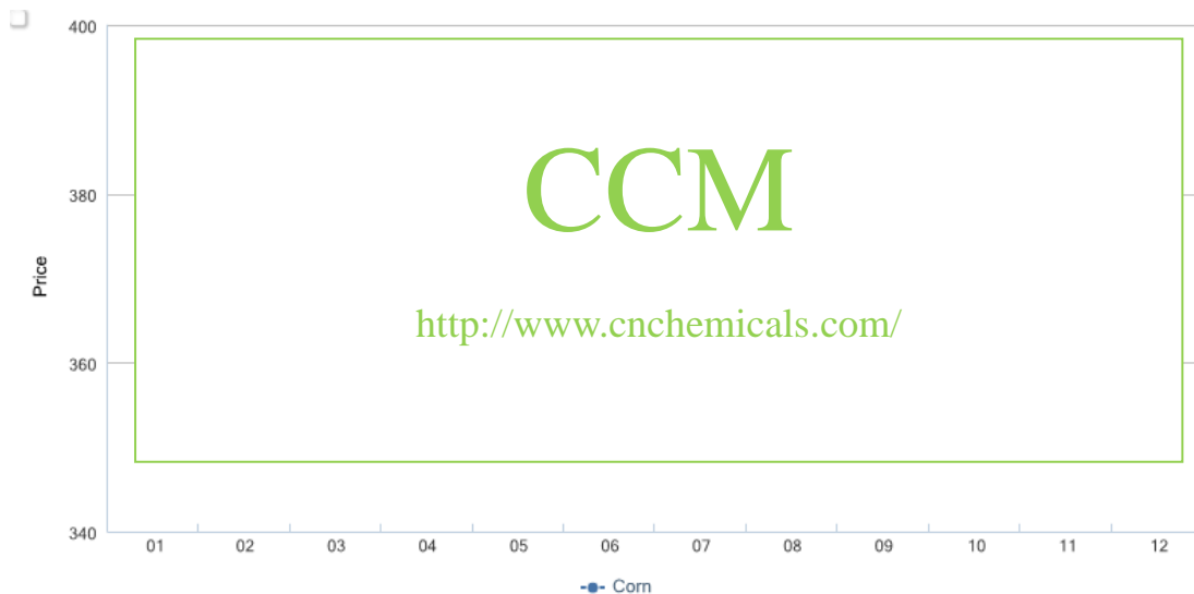
Figure 3-1 Market price of corn in China, 2013, USD/t